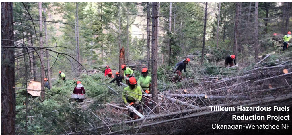
Tillicum Hazardous Fuels Reduction Project Okanogan-Wenatchee NF