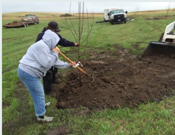
Volunteers in the community come together to plant trees around the Pow Wow grounds.

In conclusion, Parmelee gained more than the 12 new trees in their community. They gained a more comfortable environment for their people to connect with their families and culture.