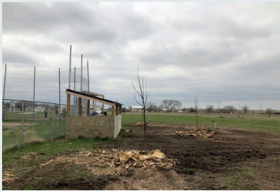
Trees planted around the new baseball field in Parmelee.