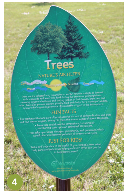
1. Kuhnert Arboretum bee sign. Photo Credit: Aaron Kiesz. 2. Kuhnert Arboretum path during sunset. Photo Credit: Aaron Kiesz. 3. Tree Sign at the Bramble Park Zoo. Photo Caption: Dan Miller. 4. Kuhnert Arboretum nature sign. Photo Credit: Aaron Kiesz.